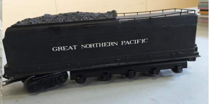
May door prize winners are just okay