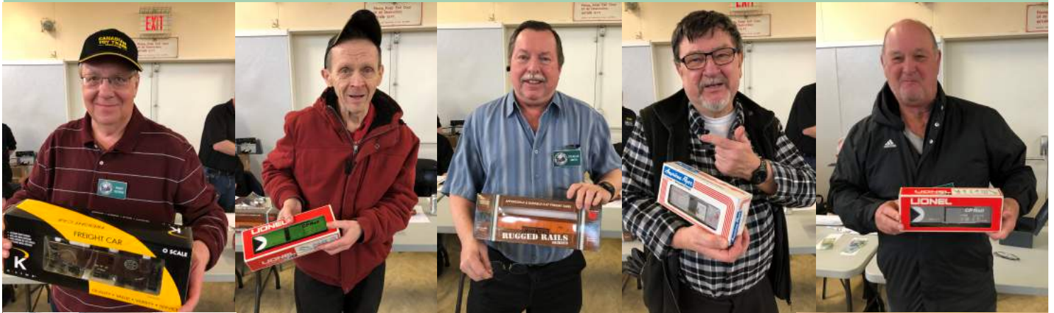
Above: January door prize winners