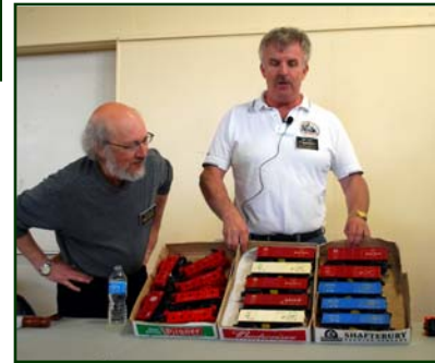
There's always something different, sometimes rare and often funky at the TTOS Auctions at each Club Meet.