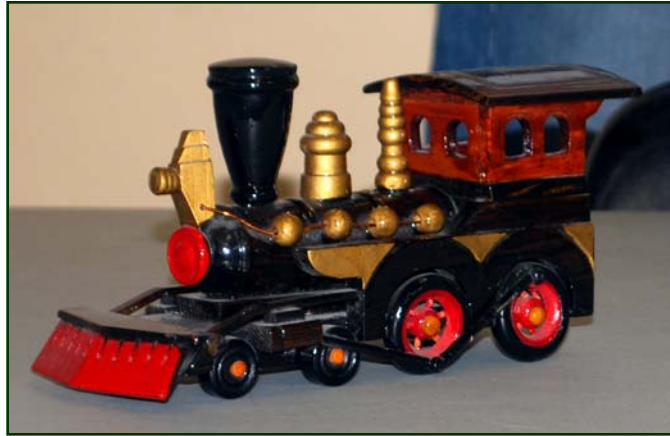
Right: This delightful toy train sold at auction in May