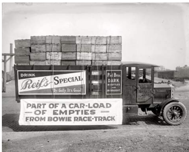
what the google brought me --

back by popular furor, the good doctor continues his wayward march through the back alleys of history. [ed]