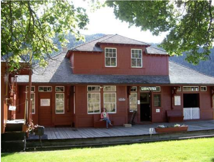
The old station at Midway, B.C. on a lovely day.