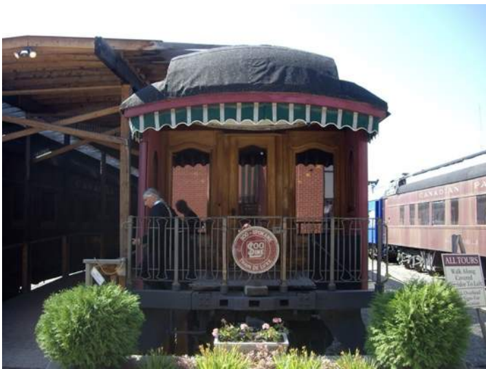
Soo Line 1907 train on display at Cranbrook.