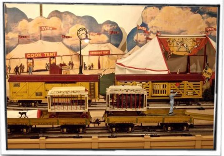
THE FAMOUS ORIGINAL IVES STANDARD GAUGE CIRCUS AS SEEN ON A TOUR AT THE SACRAMENTO TCA CONVENTION

[c. reif, secretary, canadian division ttos]