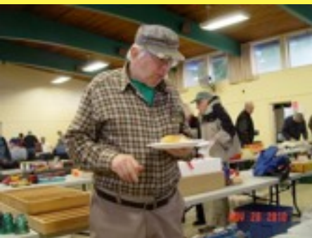
food and trains...