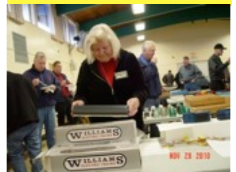
trains and food... prrrfect!