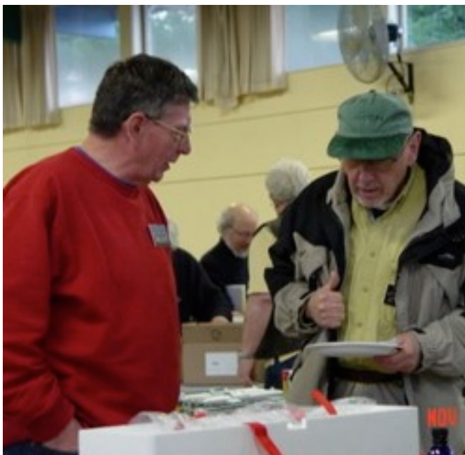
Is it a real collector plate?