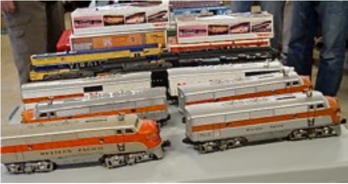
trains to buy