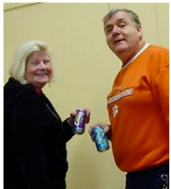
katelon's okay with "pop" a ed