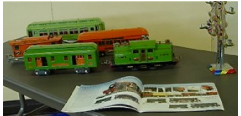
the November meet