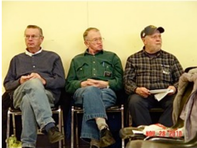
some of the island contingent, on the lookout for trains