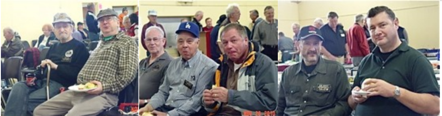
a lineup of the chew-chew boys at November's eat and meet.