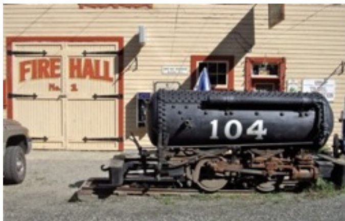
Sandon B.C. ... a steam-driven whatzit? [not a fire truck]