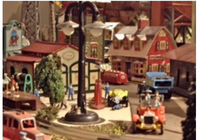
above: a busy afternoon in the village. Picture 1 in a seemingly endless series of Reif layout shots --- unless you intervene.]