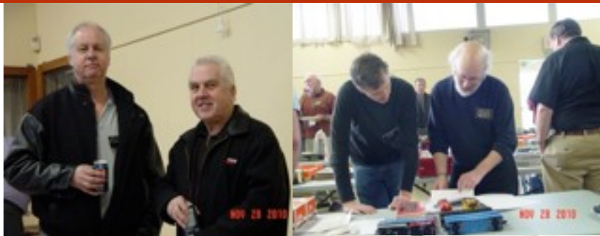
(train)men in black...

Attend the presentation by both club presidents of 2 BB&BC reefers to the Museum. More Info in next Canadian Flyer