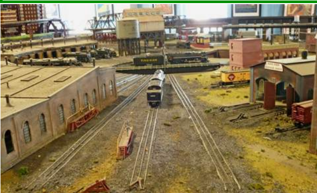
Realistic modeling of yard area [and huge roundhouse] on the NJ Hi-Railers' layout.