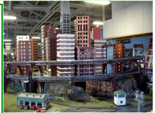
New Jersey Hi-Railer's multi-elevated lines enfold the skyline.