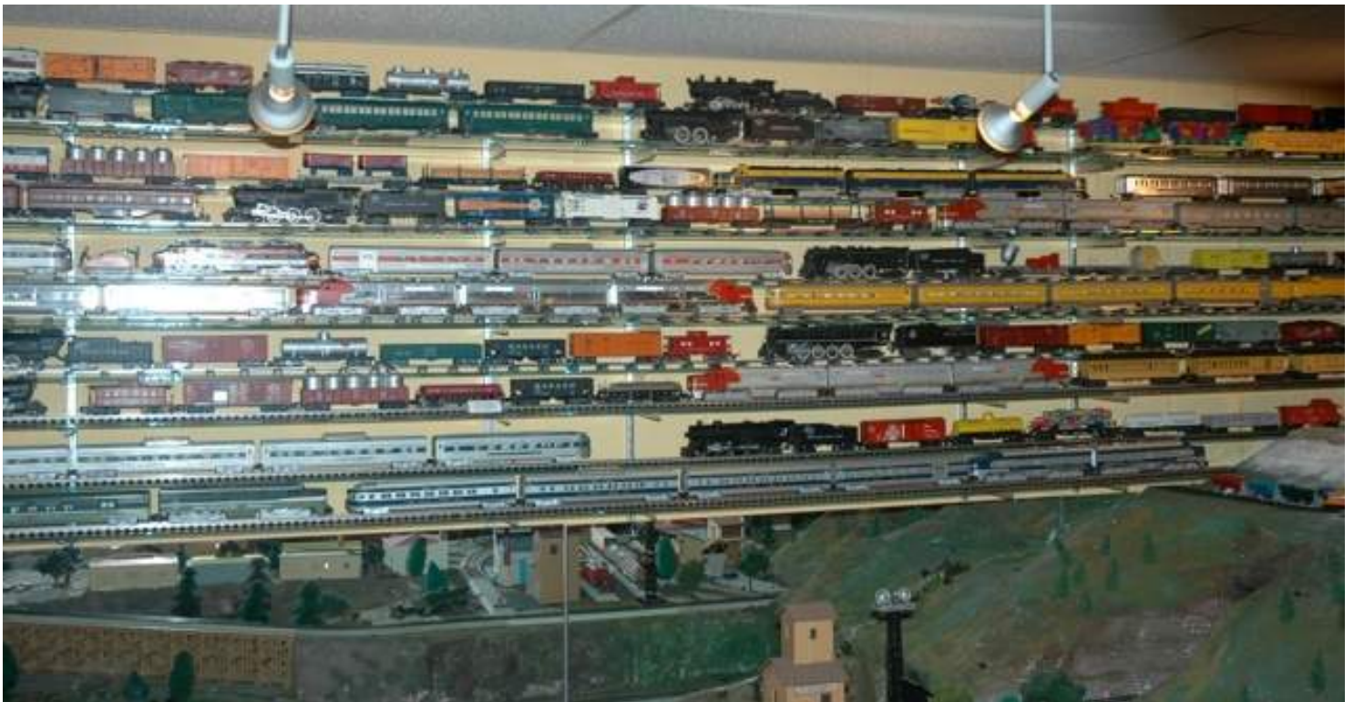
S Gauge display and layout "under glass" at the National Toy Train Museum, Strasburg PA  Old Dorfan, Bing, Marklin + very Old Lionel and some Ives