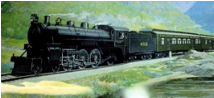
Canadian Government Railways' "Ocean Limited" on the Montreal to Halifax run, circa 1910-15. [From a poster]