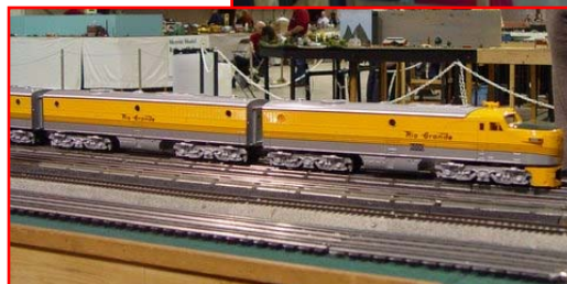
These boys love to play with their toys!