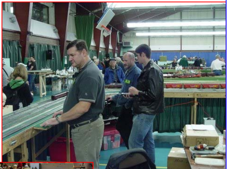
Left: — It's all about the next Toy Train generation!