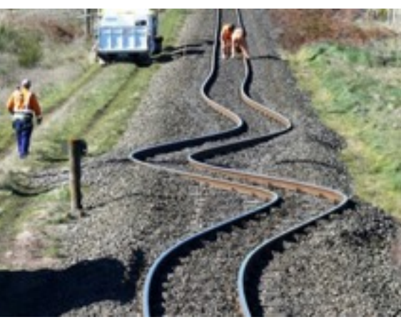
canterbury, NZ after the quake Imake mine flex-track?]