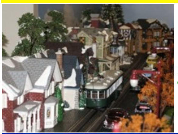
The Layout Corner