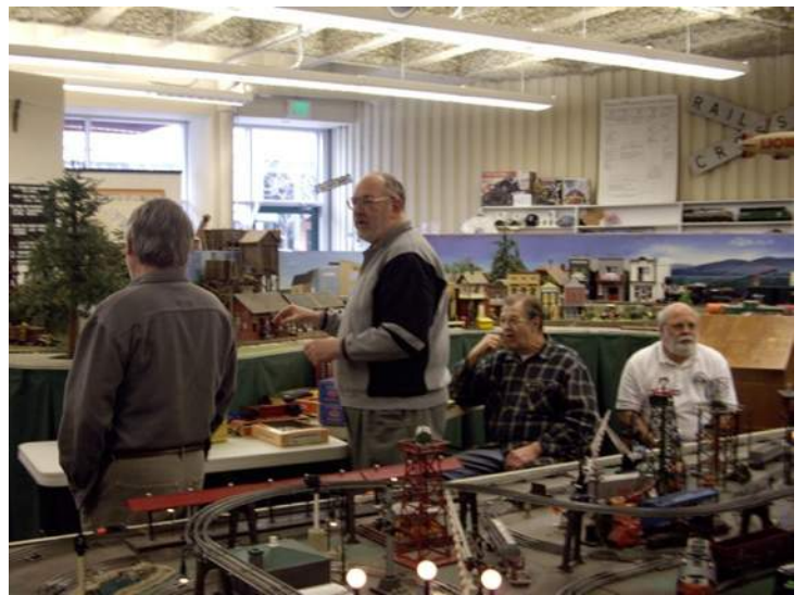
The crowd was on the edge of their seats as the auction got underway