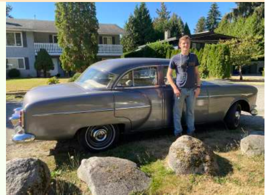
(love that tin!)