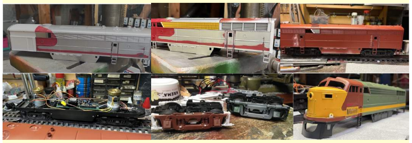
Meanwhile, the chassis and trucks were rebuilt, and new motors installed. Paint beginning to shape up. More detail added, painting nearing completion, and Here They Are! What a trip!

The Rivarossi version of the A unit didn't match the prototype. Extensions had to be 3D printed and added on, as well as a 4-vent roof grille. Doors were repositioned on the B unit.