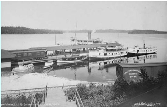
Canadian Northern Ontario docks at Lake St. Joseph