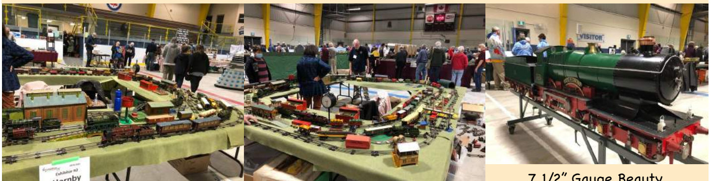
Hornby 0 Gauge clockwork on a grand scale.