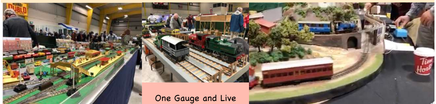
Hornby Dublo (00 gauge) electric layout. Its been taken twice to York PA.