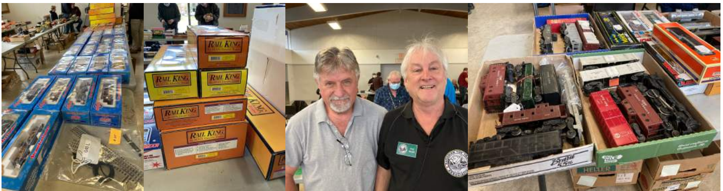
Great to see busy tables and a busy auction