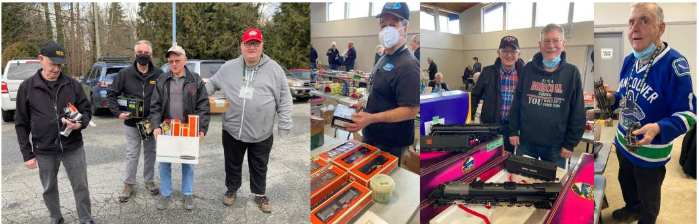
A good selection of trains at our CTTA February meeting