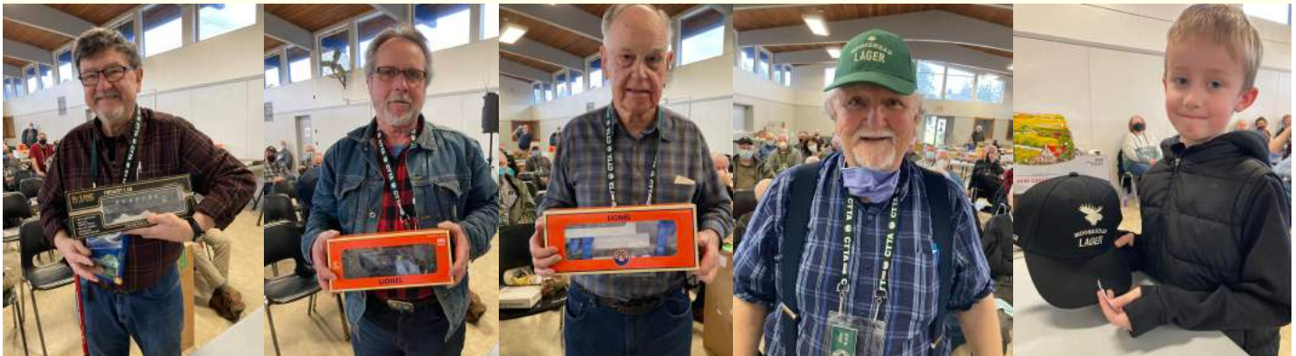
Door prizes included Moosehead Beer hats