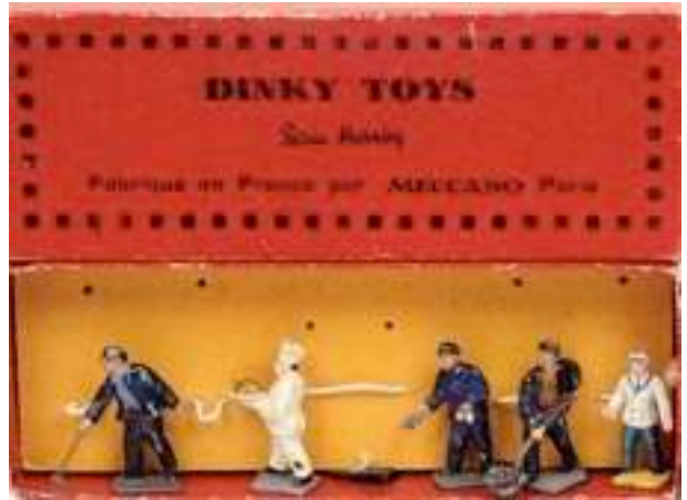
Hornby Dinky Toys English people Hornby French people