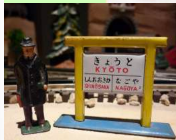
Japanese person with destination sign [Reif collection]

International Antique People Collection —how many have you? [send photos please!]