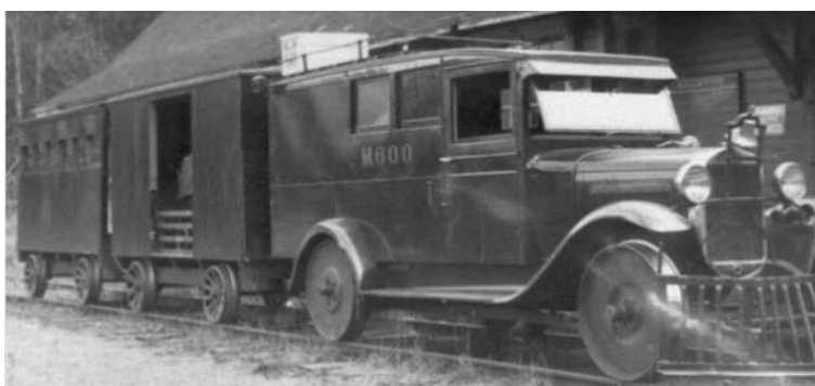
CPR's Lardeau Sub 1903-42. Kootenay Lake to Trout Lake.