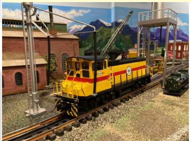
Kyle Miller gets the new BC Hydro Diesel up on the layout for a test run. Its a winner!