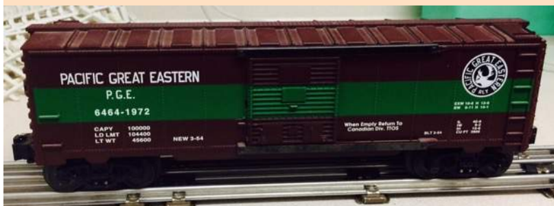
TTOS Canadian Division Car from 1996 New in the Original Box. $35 plus shipping