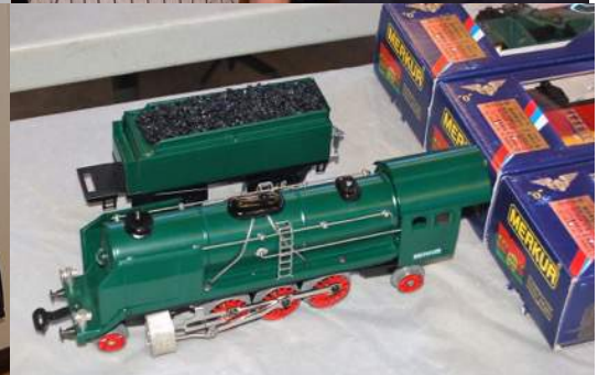
trains old (if you call a 2353 old) and new-old (Czech reissue), train collectors and operators, and what have Ed and Katelon been drinking? Magic pop?