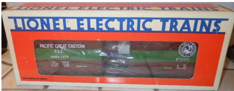
For Sale Lionel 1996 PGE Boxcar