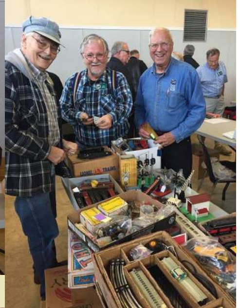
April Door Prize Winners