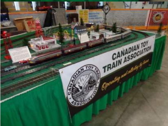
Island layout at Esquimalt Buccaneer Days, May 2017