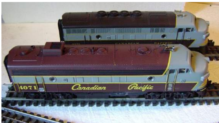
Left: Dan Gory makes a fine FP-7 from MTH F-3's (see pg. 5 online)