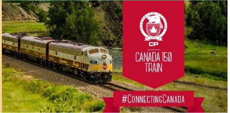
right: FP-9 by CPR. Canada 150 rocking this summer: see it July 28 at Port Moody.