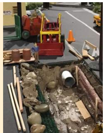
Right: sewer rebuild time comes to Mike Munk's layout (more layout pix on pg 5)