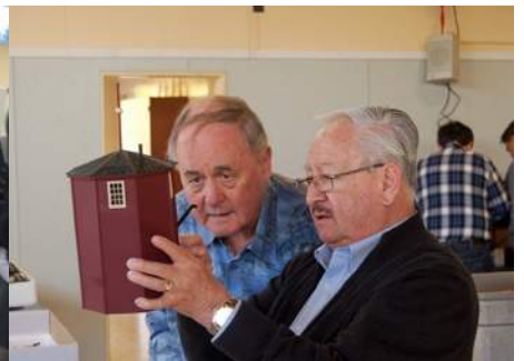
The good, the not so bad, and the pretty all findable at our CTTA meetings