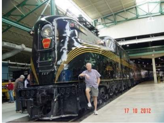
Bonuses to York << peter's dream GG1, (Penn. Railway Museum) live steam at Strasburg? >>