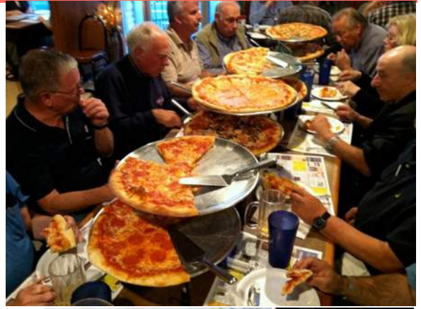
hungry work, cheap feasts! >>