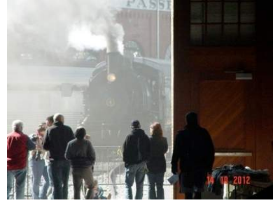
not shown: Harley Davidson factory tour, TCA Museum, B&O Railway Museum