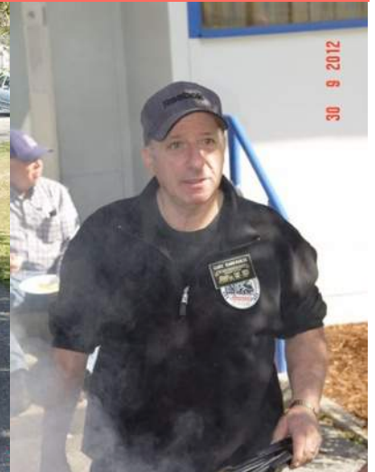
THINGS WERE COOKIN' AT THE AGM !! how do you spell summer? "september"!!