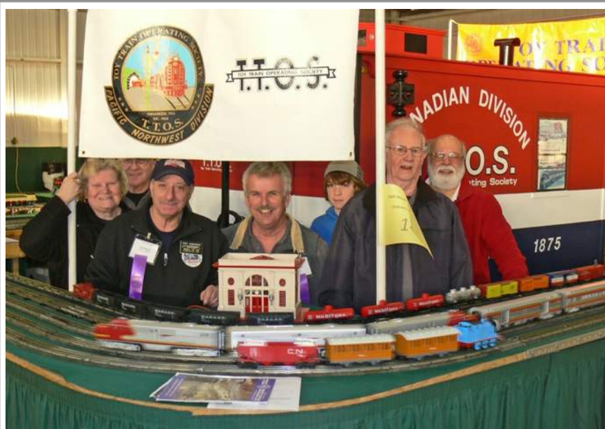
The Canadian Division Layout crew at the Monroe Show raise the Pacific Northwest Division banner as PNWD trains delight, in this successful joint effort. Canadian Division Caboose/Trailer in background.

Table Sales, Displays, Show and Tell, Door Prizes, Refreshments. Bring Trains to Sell!!